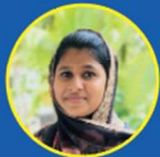
SAFLA. C NFAUSBO007