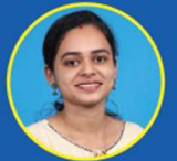
SANA. K NFAUMBT010