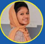
SAFEERA. KV NFAUSBO019