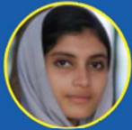
SAHALA. VT NFAUBC031