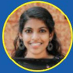
ASWANI. TP NFAUSBO011