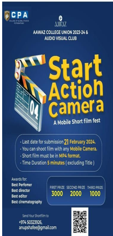
exhibit their creativity but also a celebration of their passion for filmmaking. It served as a reminder of the immense talent present within the college community and the boundless potential for innovation and excellence in the field of mobile short filmmaking.